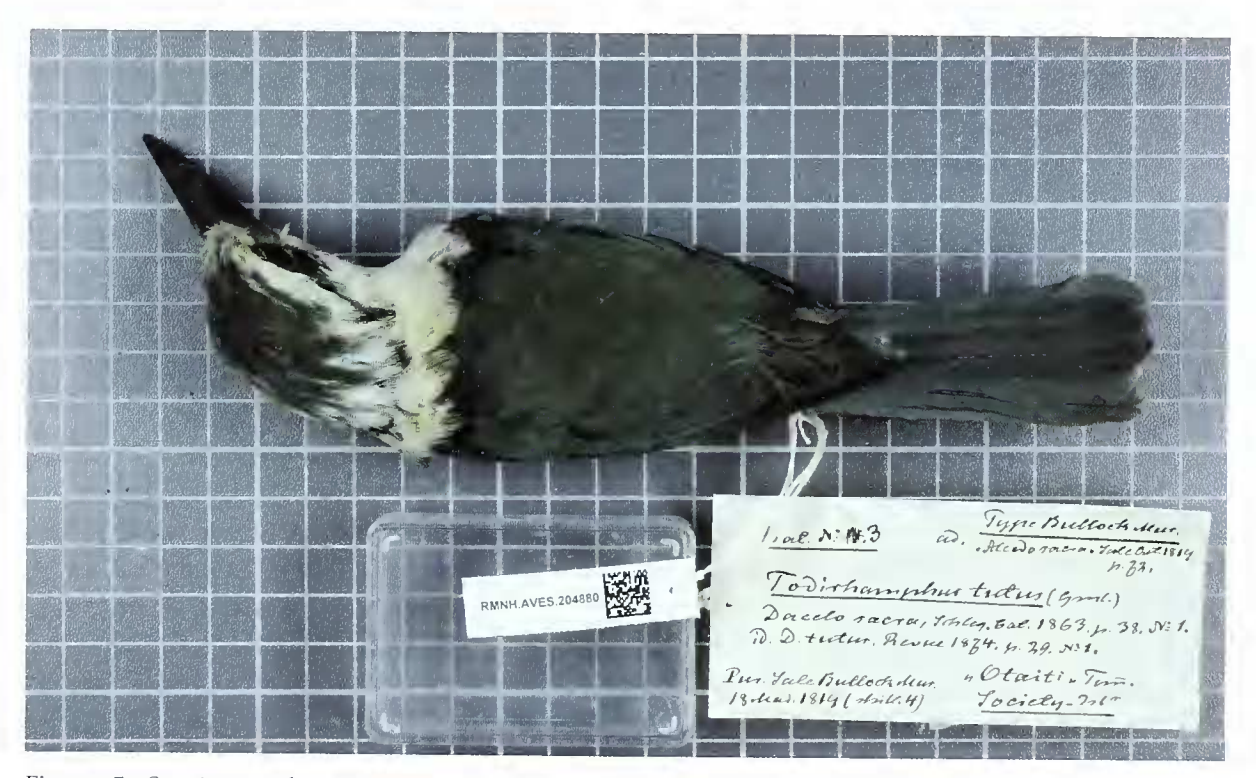
Figure 5. Specimen of adult Chattering Kingfisher Todiramphus t. tutus , Naturalis, Leiden (RMNH. AVES.204880), considered to be the type specimen by Lysaght (1959), but this cannot be confirmed